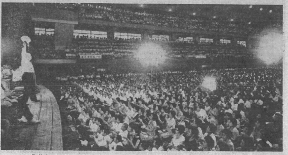
Religion der Massen — ekstatischer Redner bei einem Sokagakkei-Meeting