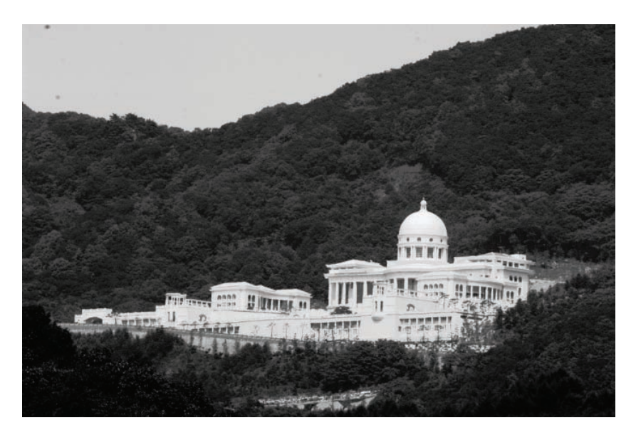
Figure 4 Ch'ŏnjŏnggung (Palace of Heavenly Righteousness, commonly called Cheon Jeong Gung or Peace Palace) in Ch'ŏngp'yŏng: the major UM landmark and 'eternal' symbol for the 'True Parents' and the 'cosmic accomplishments' of their peace movement

the time of Mun's centenary in 2020. From this one can infer that the Kingdom of Heaven on earth as adumbrated by Mun, that is, involving every single human being and bringing about world peace, will naturally be deemed in constant need of more time for the UM leadership to render it concrete. Otherwise, the UM would forfeit doctrinal cohesion and, thus, relinquish its key ideological momentum.