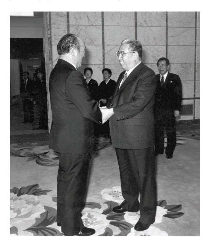
Figure 2 Mun Sŏn-myŏng meets Kim Il Sung in P'yŏngyang, December 1991

Before a discussion of the distinct millenarian setting of Unification thought, this paper examines briefly the notion of millenarianism.