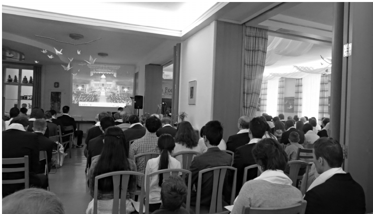
Figure 4: Austrian members at the post-Foundation Day ceremony on February 24, 2012, in the UM Vienna premises in Seidengasse 28