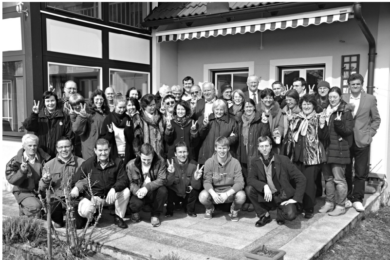
Figure 3: Group photo (March 17, 2013) of leading UM members and guests at the end of a three-day board meeting ( Leitertreffen ) of the Austrian UM held in Seeham, Salzburg, on the national implementation of the Vision 2020 agenda. Board meetings usually take place every three months