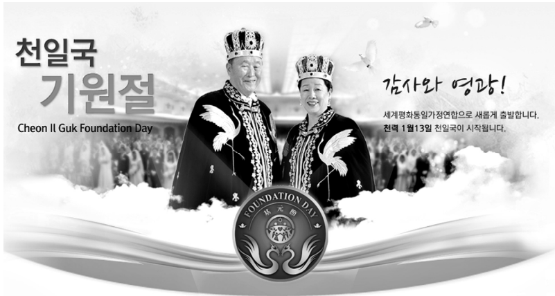
Figure 2: Foundation Day banner showing Mun Sŏn-myŏng and Han Hak-cha dressed in ritual garments. The Foundation Day emblem is depicted below. The text on the right-hand side reads: ‘Thanks and glory! A new start for the Family Federation for World Peace and Unification. Cheon Il Guk begins on January 13 by the heavenly calendar’